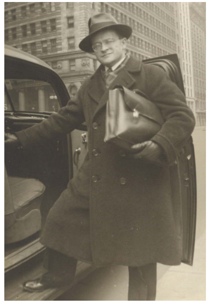
Figure 1. Vytautas Bacevičius in Chicago, 1940

From this perspective, I chose Vytautas Bacevičius, the most controversial figure among Lithuanian immigrants, for a more detailed analysis. His musical career in emigration was particularly strongly affected by the political tensions of the Cold War, even though the composer was not a political refugee. In 1938,