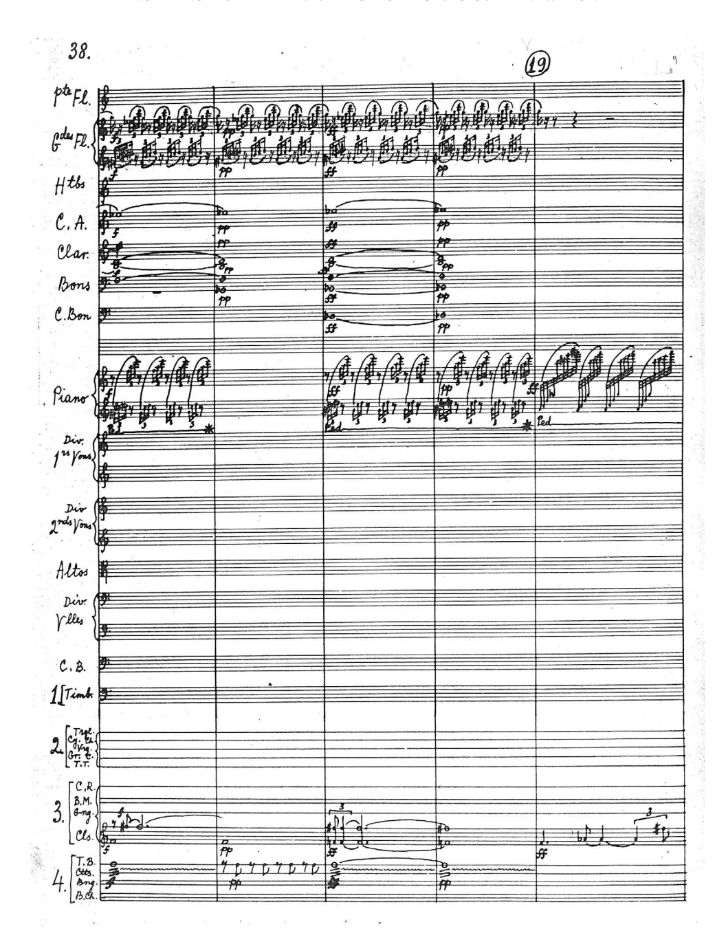
Example 3. Vytautas Bacevičius, Graphique , Op. 68 (1964). Sound type of fluctuation sound ( Fluktuationsklang ). Music Information Centre Lithuania