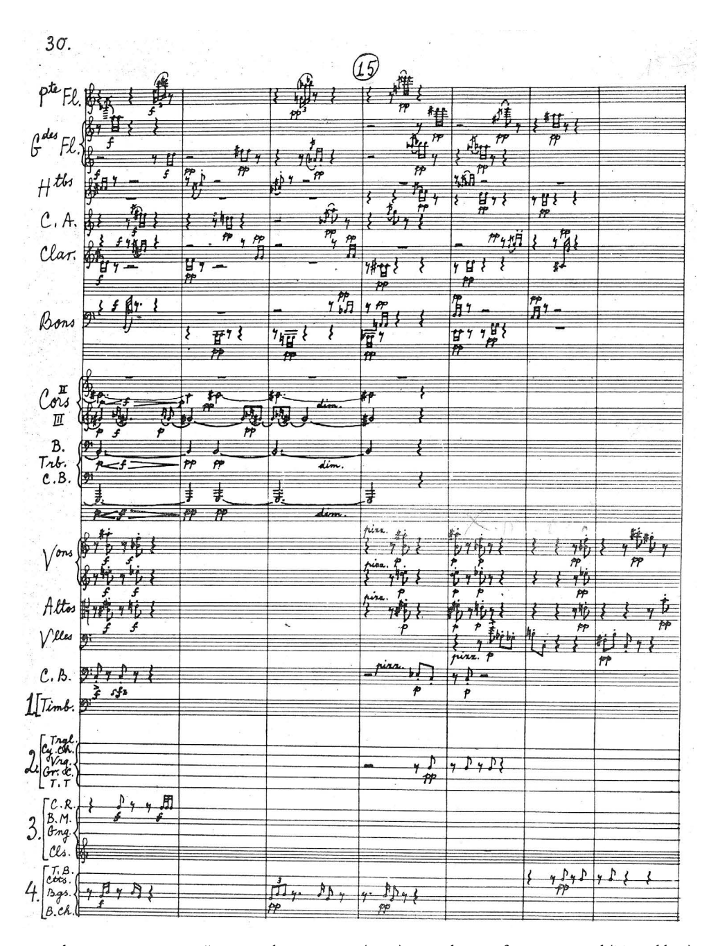
Example 2. Vytautas Bacevičius, Graphique , Op. 68 (1964). Sound type of texture sound ( Texturklang ). Music Information Centre Lithuania