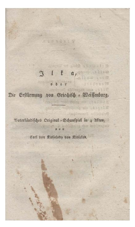
Ill. 1: Frontispiz, in: Carl von Kisfaludy von Kisfalud: Ilka oder die Einnahme von Griechisch-Weissenburg, Vaterländisches Original-Schauspiel in 4 Akten. s.l: s.a. (handwritten addendum in the volume used for this article: Pest, 1814)

The historico-political message is meagre, with the whole plot centering around a standard captivity-story like so many others. The only difference is that the setting is not in the Levante but in Belgrade. Here the author might have been influenced by the real historical battle of Belgrade in 1789, which happened two years before the London premiere of the piece in 1791. As comic-opera the main aim of Cobb's The Siege of Belgrade was to entertain the audience rather than to provide historically correct information or to encourage the recipients to reflect upon their own situation.